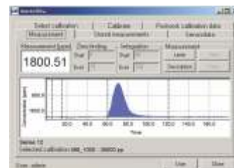
Fig. 3 View of a measuring curve.

The carrier gas supply ensures an accurately determined O2 concentration for complete oxidation (Fig. 2) and is adjustable to user-configurable ranges. A valve prevents gas exchange, so the O2 detector measures only the oxygen consumed.